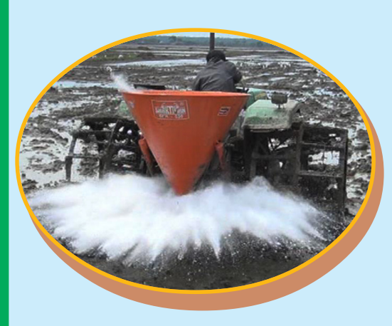
Lime application being demonstrated at Ponnamutha Kolepadavu.

The R&D team of KAU's Food Security Army (FSA) has developed a system of protocols to use fertilizer broadcaster as lime applicator. After farm trials at ARS Mannuthy, this was successfully demonstrated at Ponnamutha Kolepadavu on October 20 and found very successful in applying lime at the prescribed rate of 600kg/ha. This machine has come out as a boom to kole land farmers, who were facing acute problems for lime application. Manual workers claim nearly Rs.3-5/ kg of lime application whereas using this machine, the cost can be brought down to Rs. I/kg. This will help to restore the normal practice of lime application in kole lands and rice productivity of more than 10 tonnes/ha. This equipment is operated through the PTO operated tractor and is mounted on three point linkage. Its hopper is conical in shape and can hold nearly 450 kg of lime material.