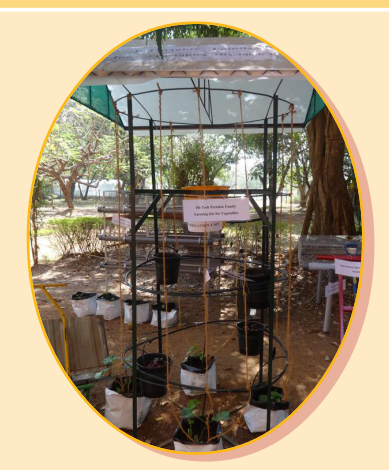
Family farming structure developed by Agri. Engg. Department of CoH. Vellanikkara

The FaFa kit can be located in the backyard or terrace depending on the availability or constraints of space in a house or apartment. Each family can grow the vegetables of their choice to control their food and nutritional security. The kit indeed is a helping hand to bring back homestead food security concepts so popular in Kerala homes in yester years.